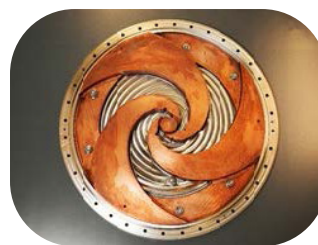
magnet spiral sections